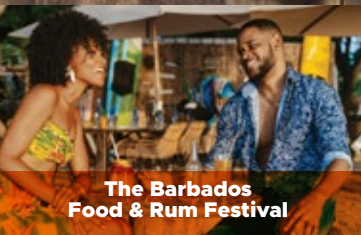
The Barbados Food & Rum Festival

Bajans love to party; whether you're in 1st & 2nd Street Holetown, on the West Coast, or the ever-popular St. Lawrence Gap on the South Coast; there are numerous clubs and bars to choose from for a fantastic night out!