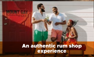
An authentic rum shop experience