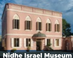
Nidhe Israel Museum

So just say yes to that first rum punch, and you'll soon ease into the spirit of island life. As the saying goes, time flies when you're having rum.