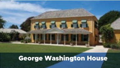
George Washington House