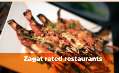
Zagat rated restaurants