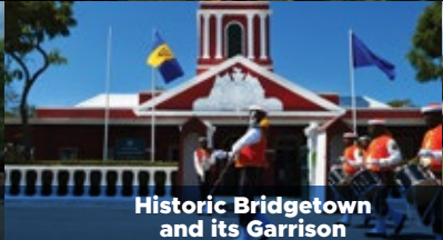
Historic Bridgetown and its Garrison