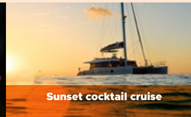
Sunset cocktail cruise